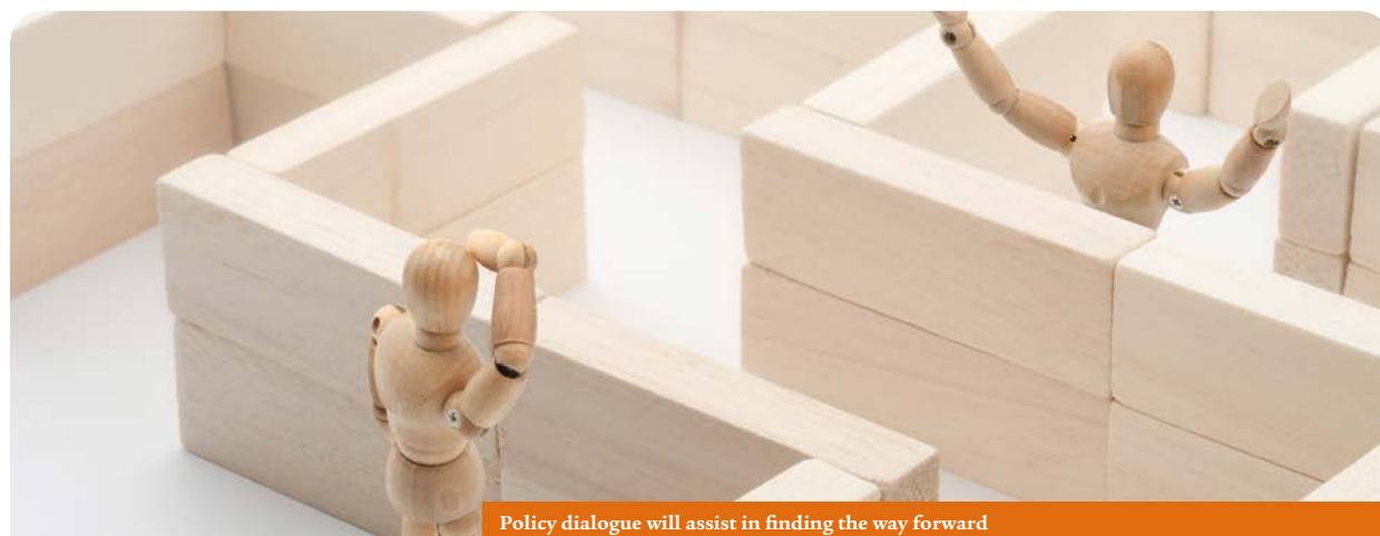
Policy dialogue will assist in finding the way forward