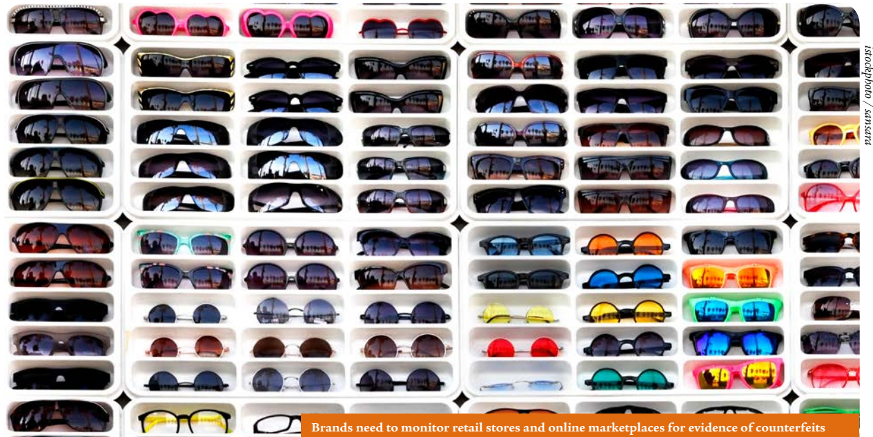
Brands need to monitor retail stores and online marketplaces for evidence of counterfeits