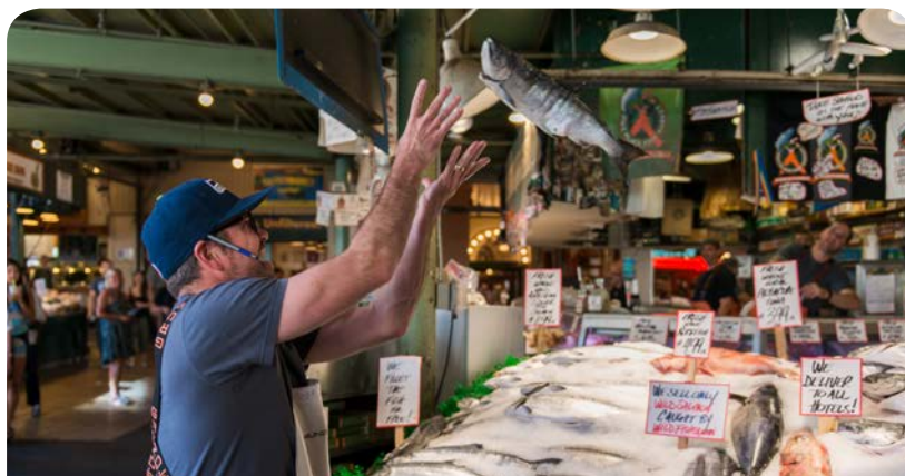
Pike Place Market: famed for its “fish throwing” tradition