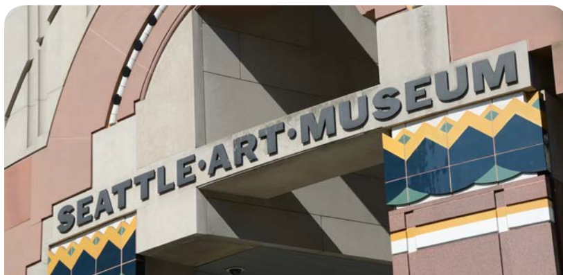
Seattle Art Museum: a 10-minute walk from the Convention Center