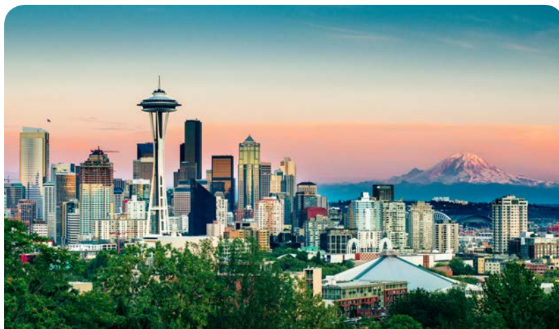
Space Needle: provides impressive views of the city and its surrounding landscape

If you want to sit back and let somebody show you around the city in a wacky style, the lively Ride the Ducks land and sea tour will keep you entertained. The Duck is a World War II amphibious