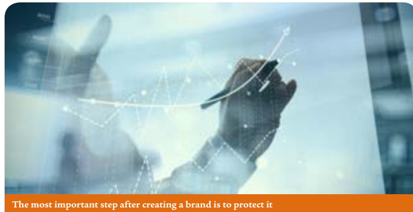
The most important step after creating a brand is to protect it

These include: Which classes should we seek trademark protection in? Which jurisdictions should we file in? Should